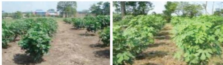
Gráfica 3. Cosecha manual de hojas de Chaya en el sitio UVG Sur