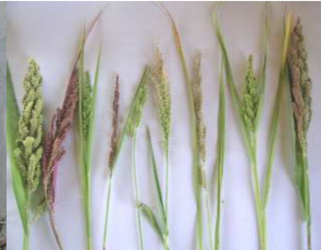
Minor millets, Rewa