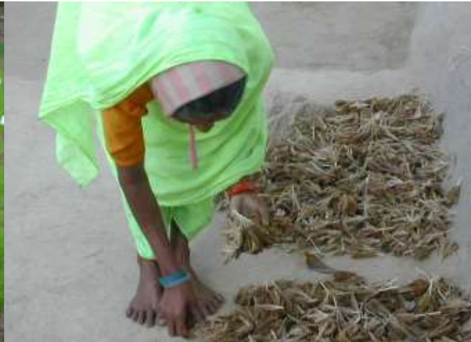
Collection of NTFP in Mandla