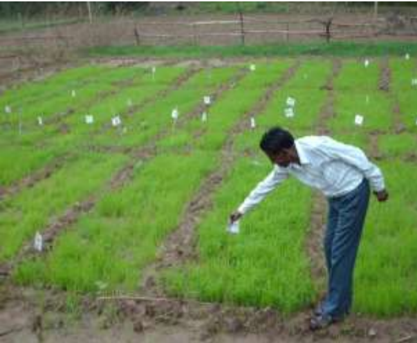
Local Varieties of Rice, Satna