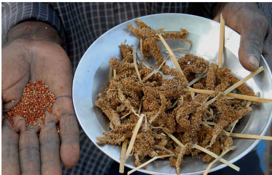
Finger millet.

NUS, or Neglected and Underutilized Species, are wild, cultivated or semi-domesticated non-commodity crops at the margin of mainstream agriculture. Their contribution to tackling food and nutrition insecurity and climate change vulnerability is huge and can no longer be overlooked. They might not be 'neglected' for much longer.